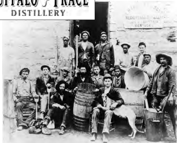
The Distillery in 1870.