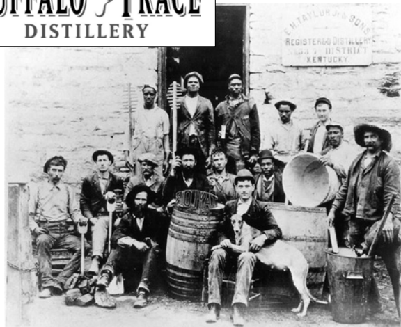
The Distillery in 1870.